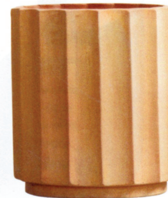
COLUMN PLANTER BY BILLY COTTON 24" dia. x 27" h.; $2,300. seibert-rice.com