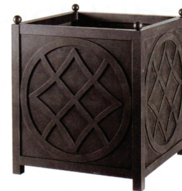
LITCHFIELD PLANTER BY BUNNY WILLIAMS 24" sq. x 27.5" h.; $1,650. centuryfurniture.com