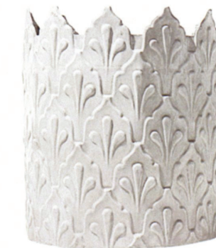
ROYAL CROWN PLANTER 28" dia. x 30" h.; $2,300. pennoyernewman.com