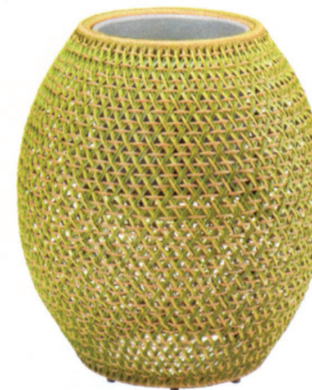
DALA PLANTER BY STEPHEN BURKS 30" dia. x 32.5" h.; $1,290. dedon.us